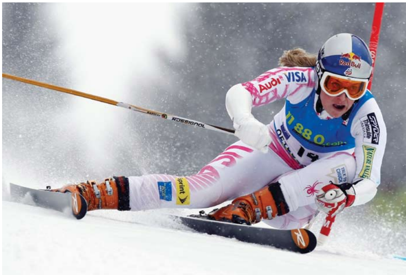
Lindsey Vonn speeds down the course during the first run of an alpine ski, Women's World Cup Giant Slalom race, in Ofterschwang, Germany, Friday March, 6, 2009.

Downhill skiers know about injuries, so when Lindsey fell—make that crashed—during a 2006 Super G training run in Austria, she knew something bad had happened. "I was going real fast and something caught the edge of my ski. I did a few somersaults and hit my left knee 'kind of