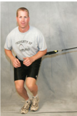
Side step against resistance