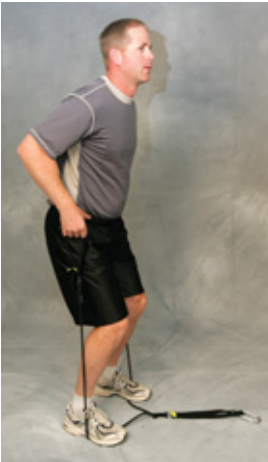
One-third knee bends