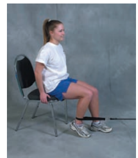
Carpet drags/hamstring curls