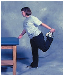
Standing quadriceps stretch