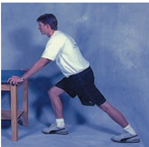
Standing calf stretch