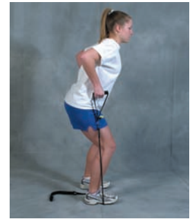
Double/single leg knee bends

Standing quadriceps stretch: Stand on one leg while bringing the heel of the other leg toward your buttocks. Maintain