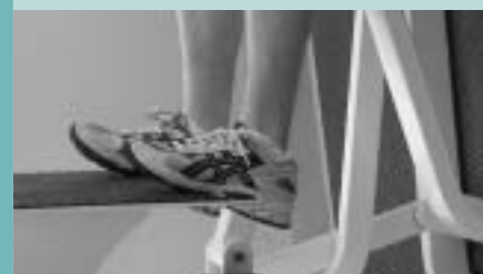
Calf Press 2