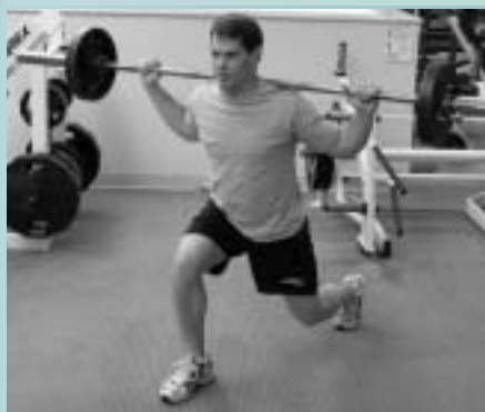
Reverse Lunge 2