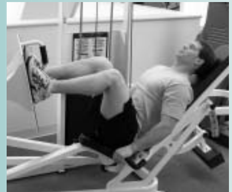
Double Leg Press 1