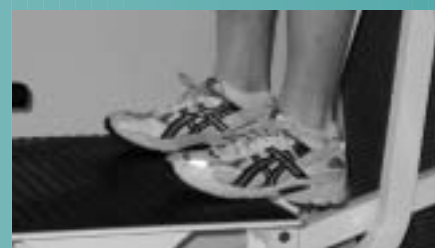
Calf Press 1