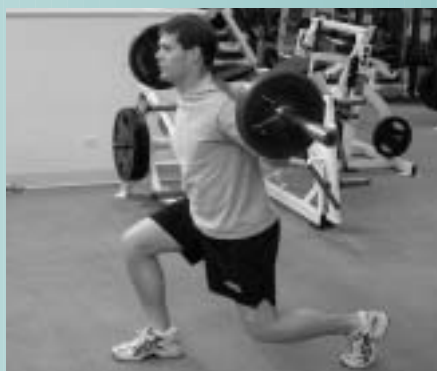
Reverse Lunge 1