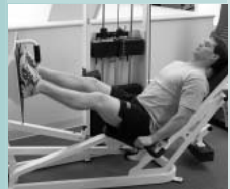
Double Leg Press 2