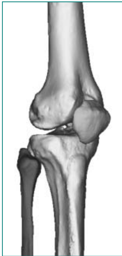
Three-dimensional model of the knee.

The Biomechanics Research Laboratory is heading up an ambitious project to determine why females are more prone to ACL injuries. By observing, in our lab, how females and males land differently from a jump, we have identified specific and consistent differences in how females land, some of which may make them more prone to ACL injury. Most obvious is the fact that females land less flexed at the knee joint. This puts the ACL in a position where it must withstand considerably more load than if they were to land in a more flexed knee position. With this information, Foundation Senior Staff Scientist Dr. Kevin Shelburne and Dr. Marcus Pandy of the University of Texas are working to develop a computer simulation of this motion. The hope is to understand just why the ACL ruptures in