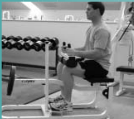
Seated Calf Press, 1

As always, it is important that you consult with your physician before starting any exercise program, if you are experiencing any joint or muscle pain, or rehabilitating from injury or surgery.