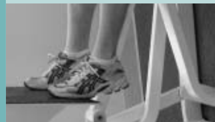
Calf Press 3